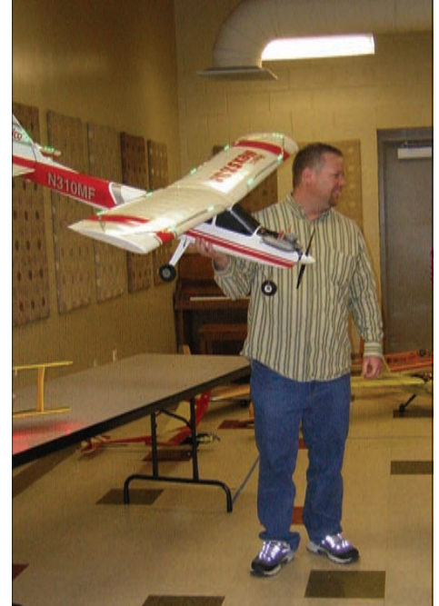
It seems I miss-placed my list that had everyone's name on it.